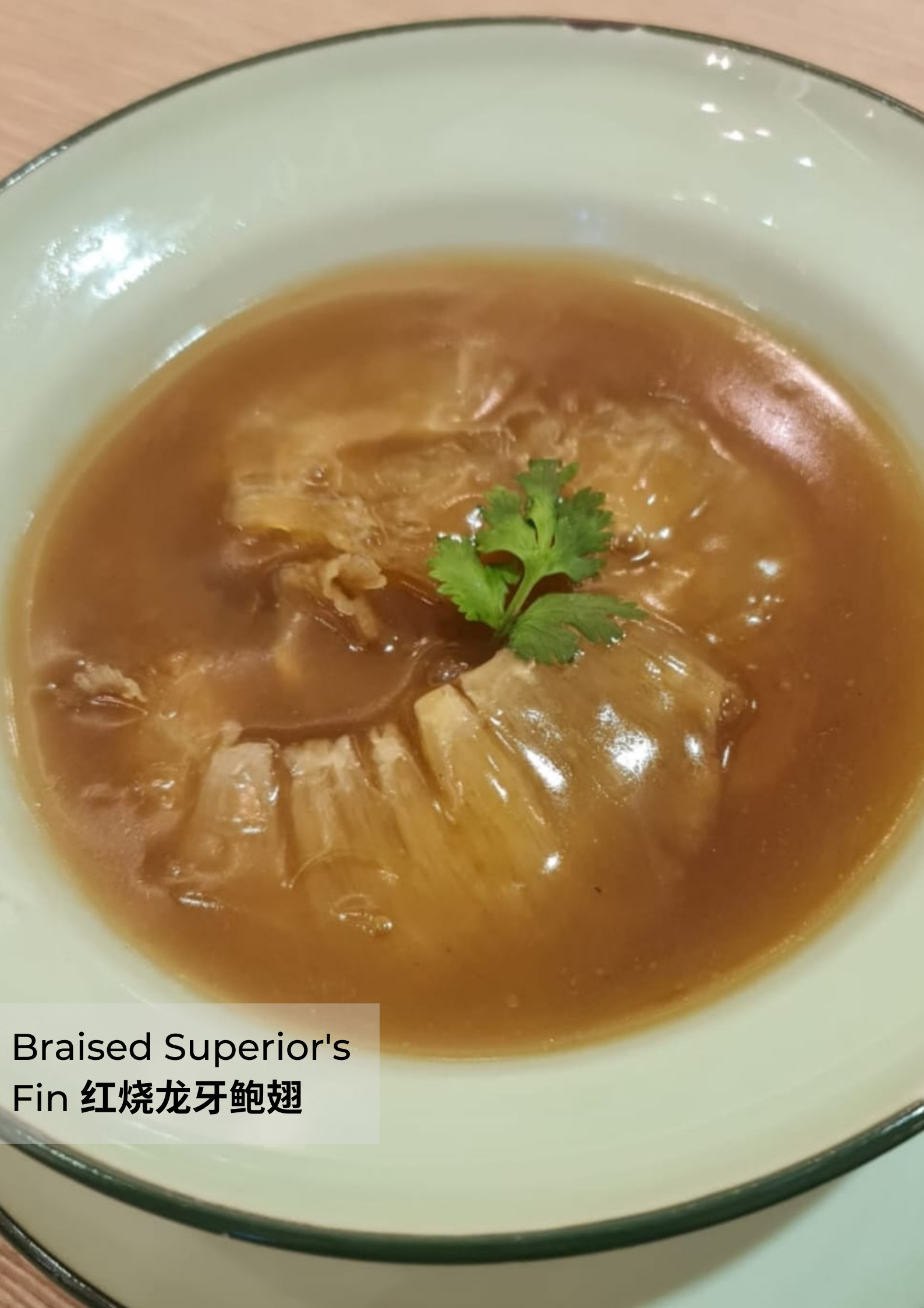
Braised Superior's Fin 红烧龙牙鲍翅