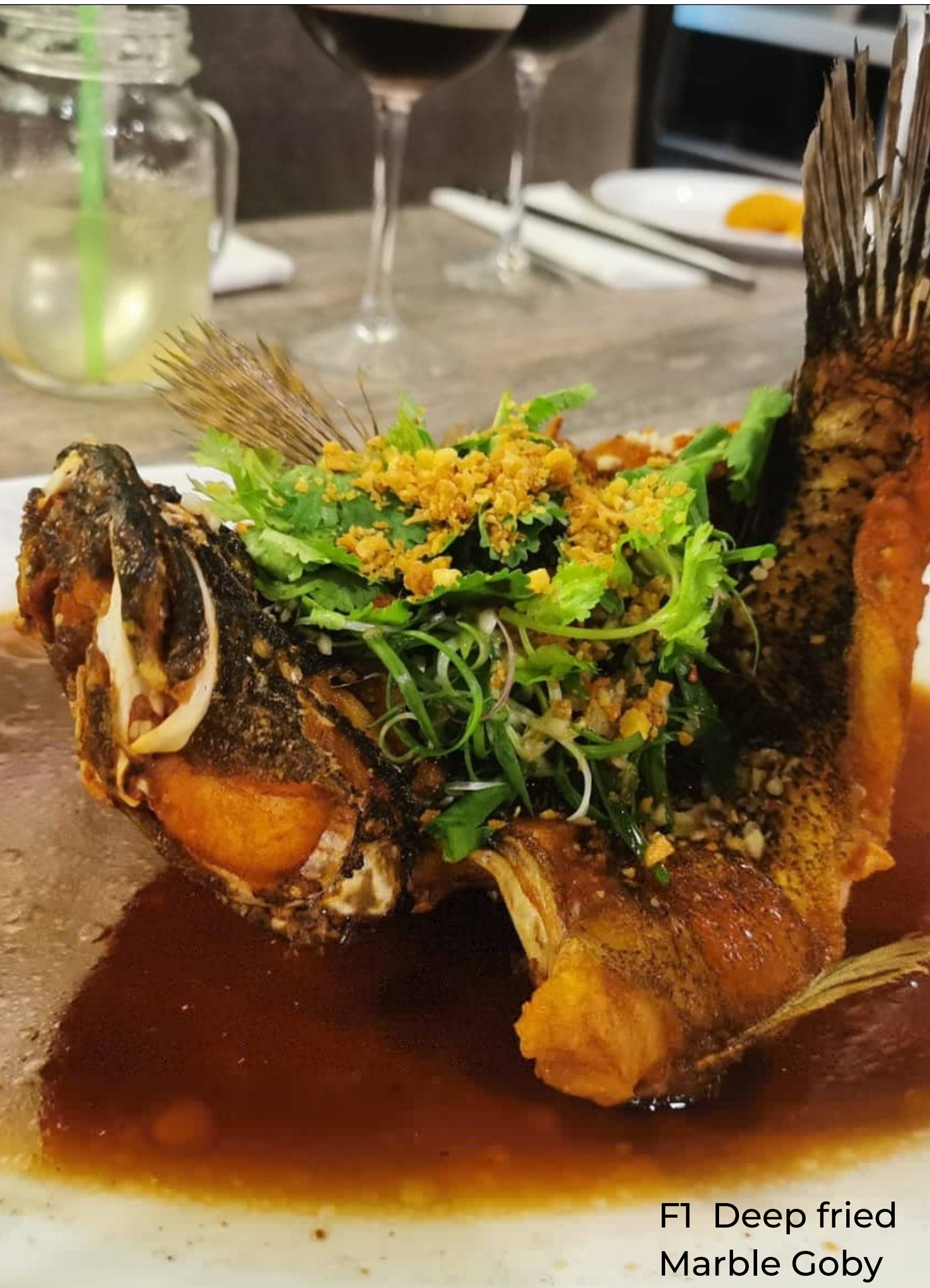
F1 Deep fried Marble Goby