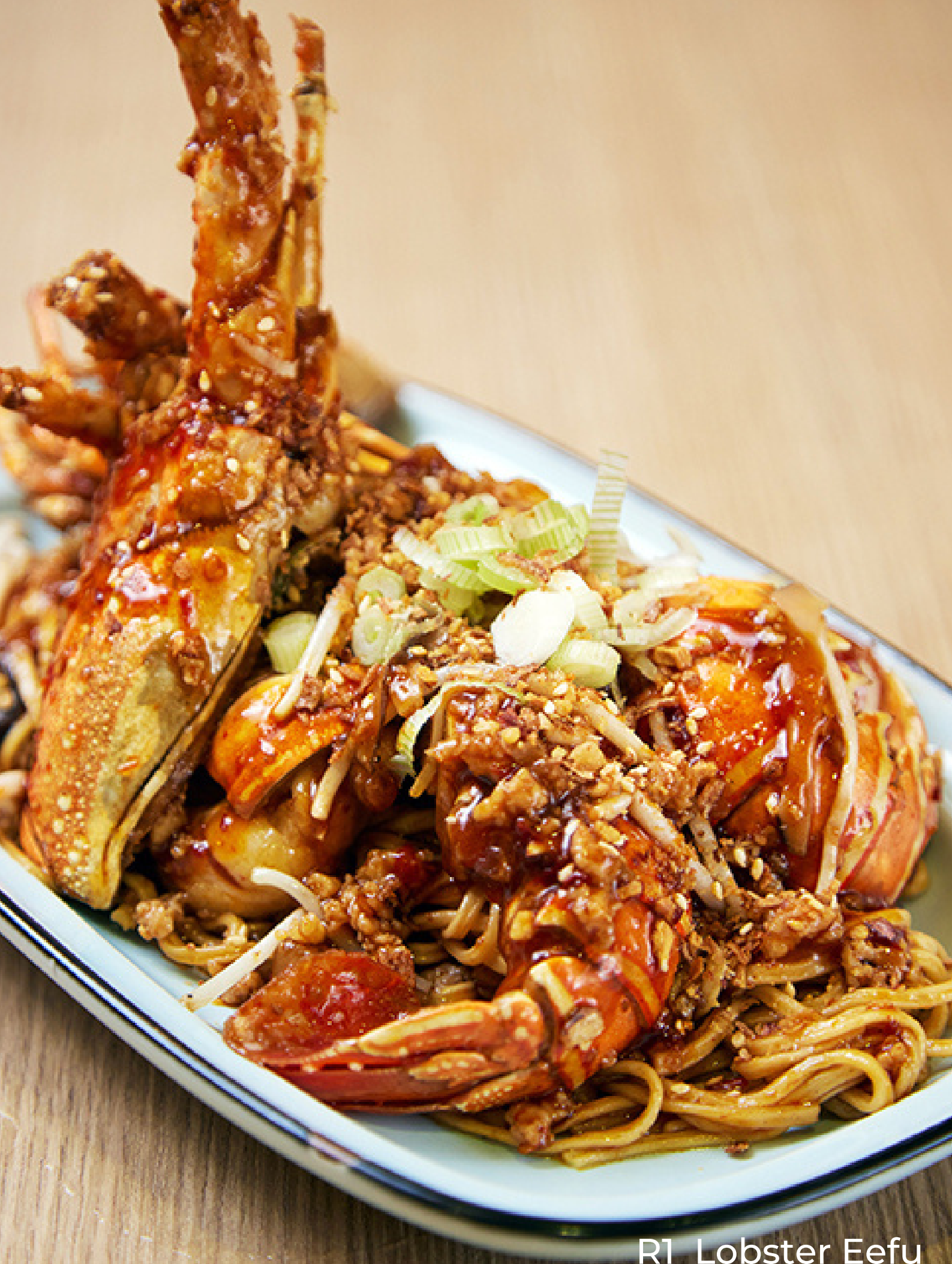
R1 Lobster Eefu Noodles