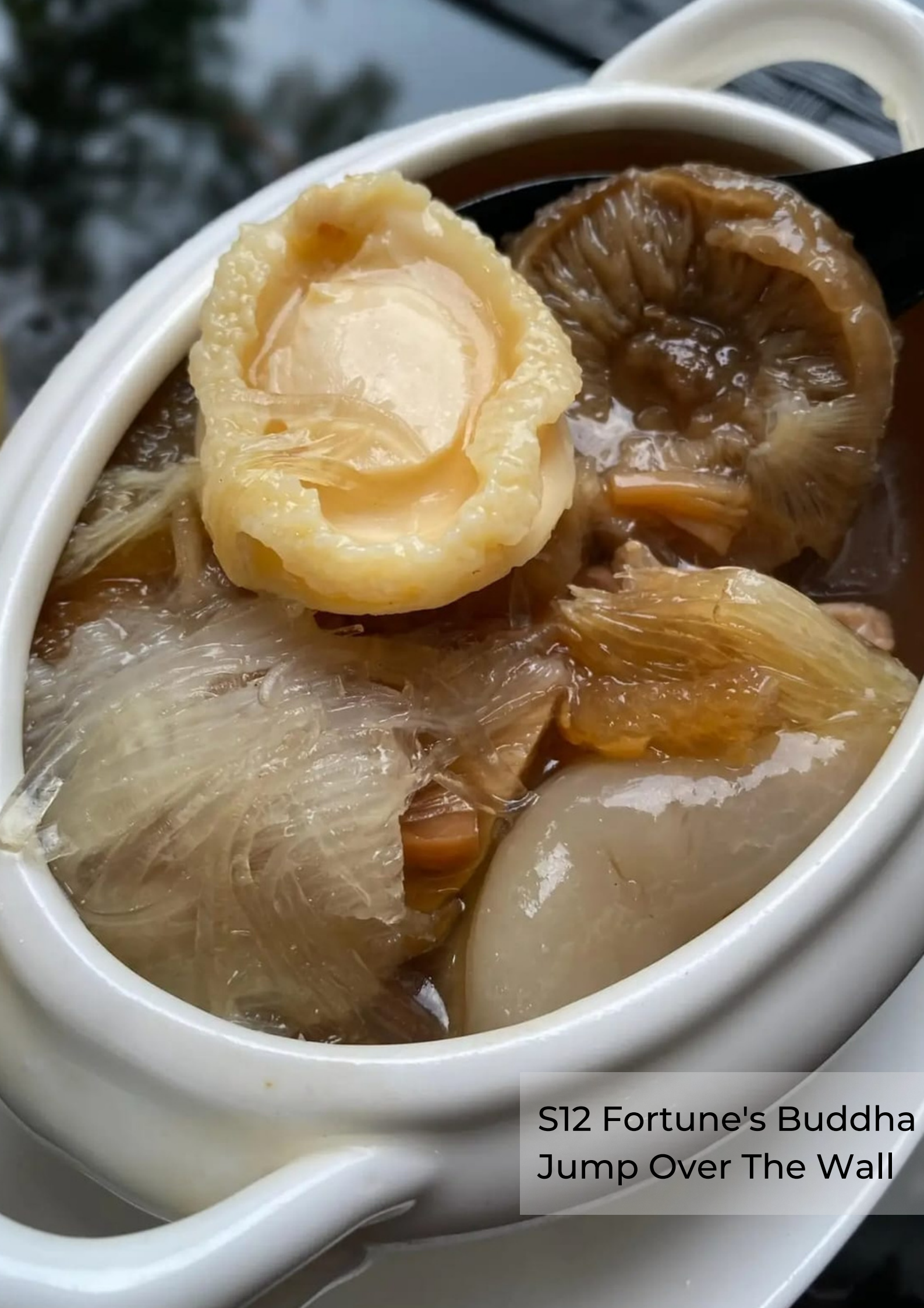
S12 Fortune's Buddha Jump Over The Wall