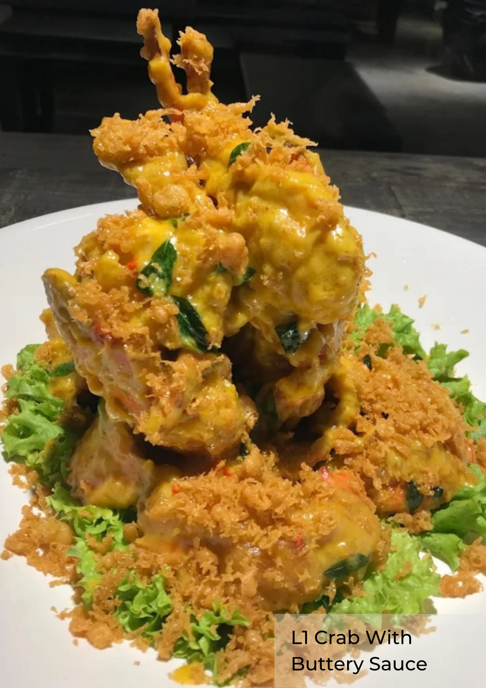
L1 Crab With Buttery Sauce