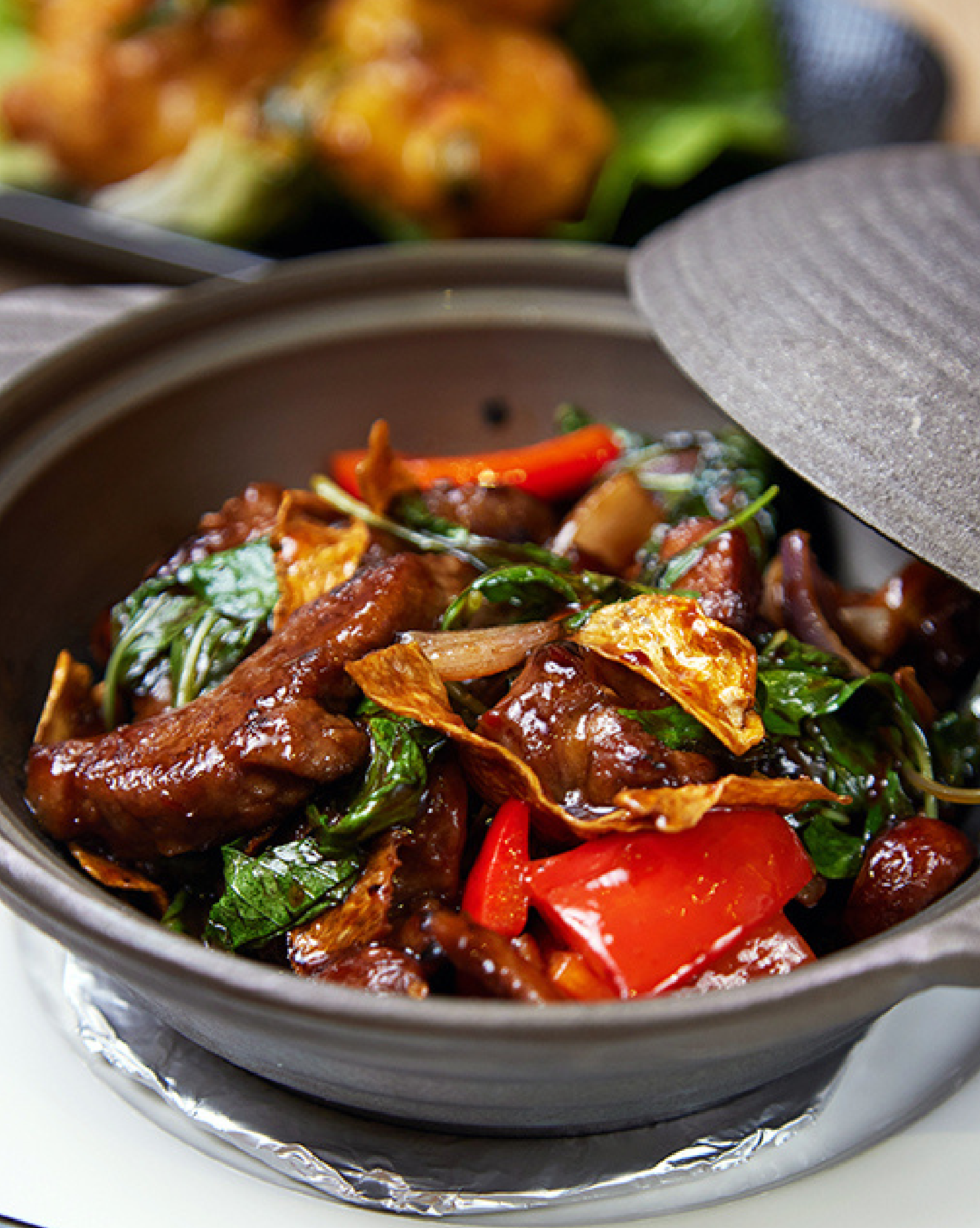
M1 Three Cup Beef