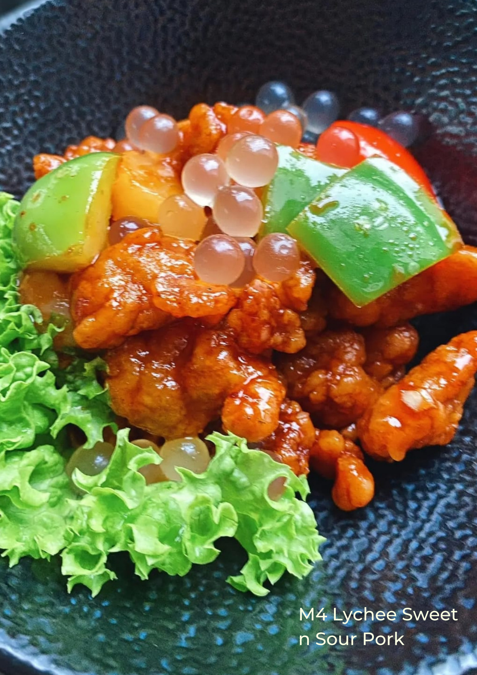
M4 Lychee Sweet n Sour Pork