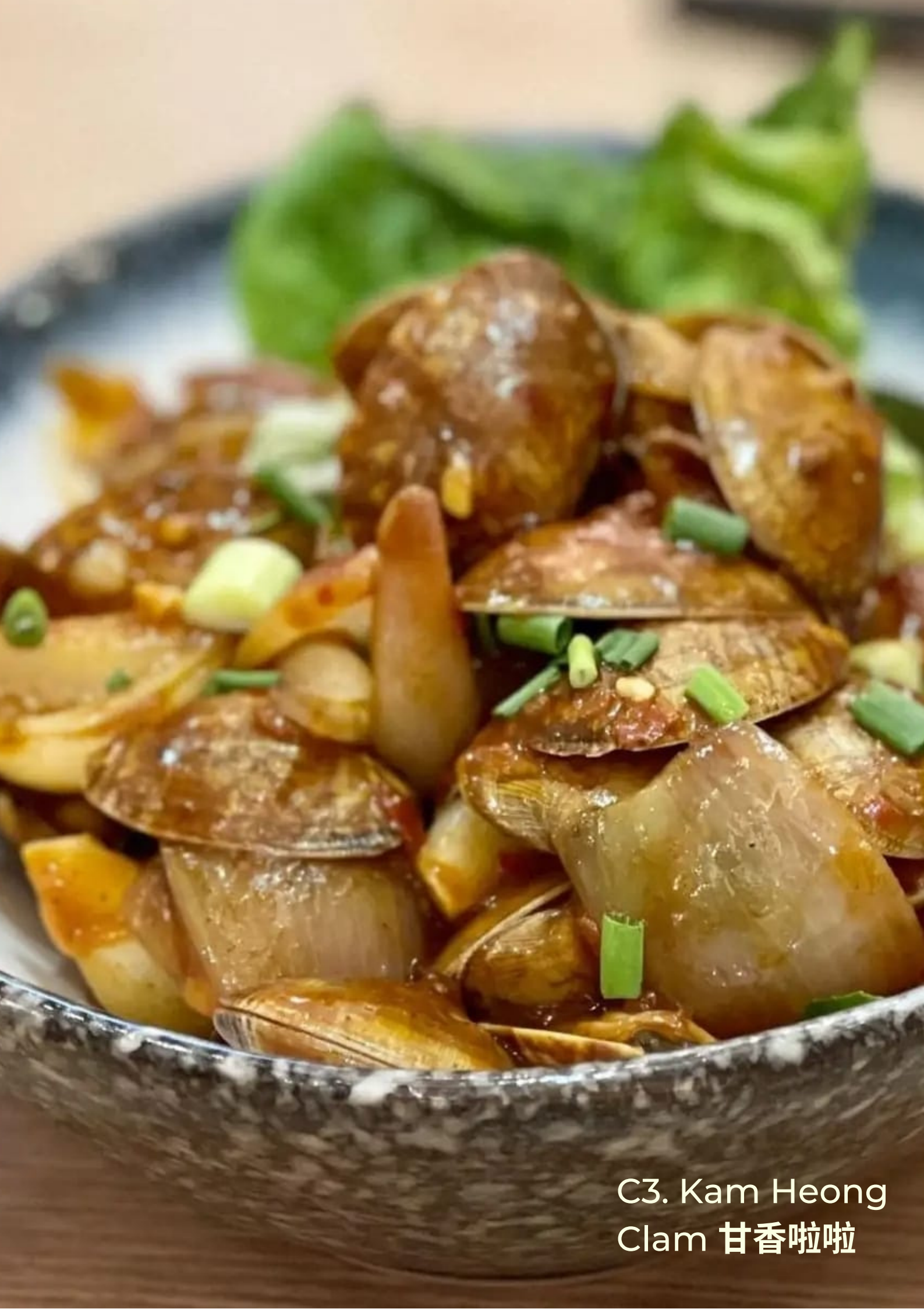
C3. Kam Heong Clam 甘香啦啦